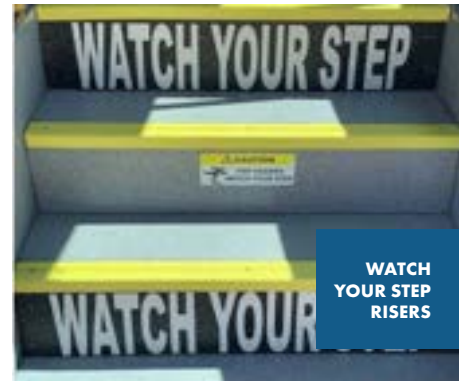
WATCH YOUR STEP RISERS