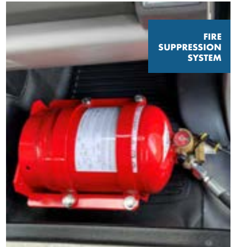
FIRE SUPPRESSION SYSTEM