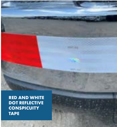
RED AND WHITE DOT REFLECTIVE CONSPICUITY TAPE