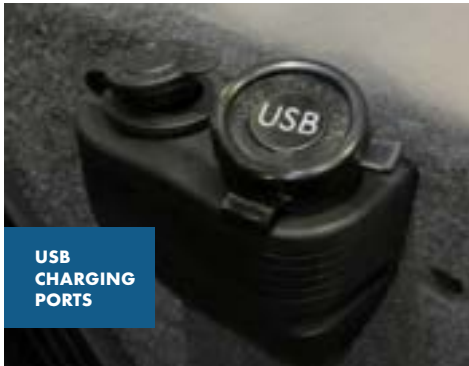
USB CHARGING PORTS