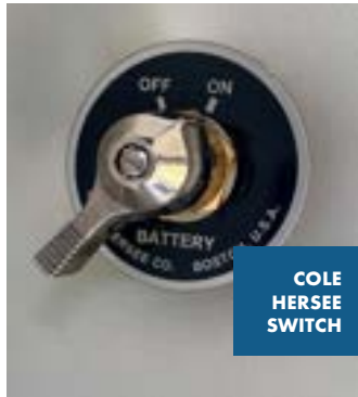
COLE HERSEE SWITCH