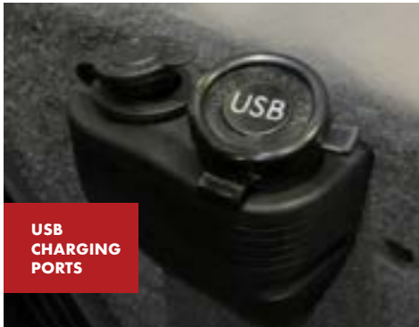
USB CHARGING PORTS