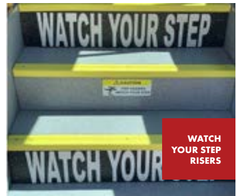
WATCH YOUR STEP RISERS