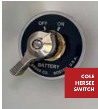
COLE HERSEE SWITCH