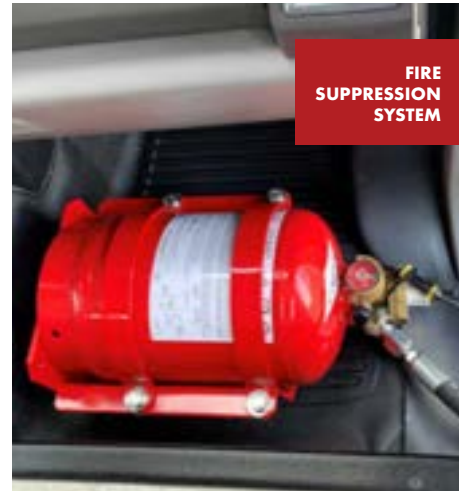
FIRE SUPPRESSION SYSTEM