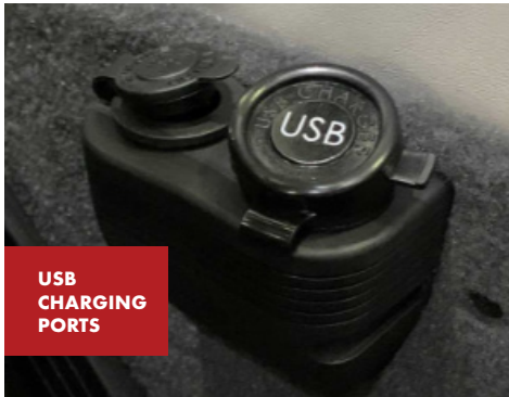
USB CHARGING PORTS